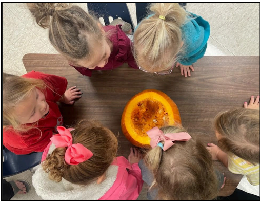
PreK 3 dissection a pumpkin