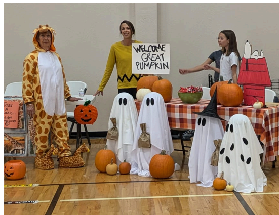
Trunk or Treat fun with Charlie Brown and SJE's favorite giraffe