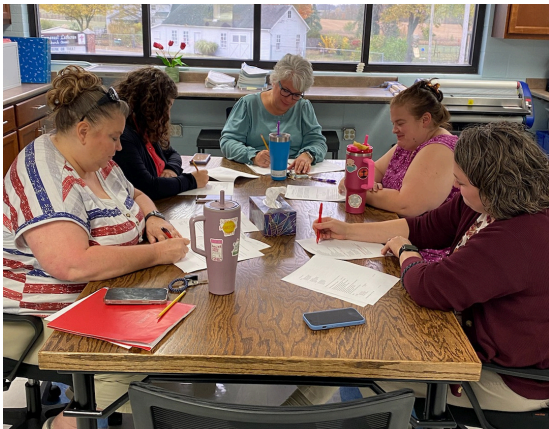
Soest teachers collaborating in their new conference room