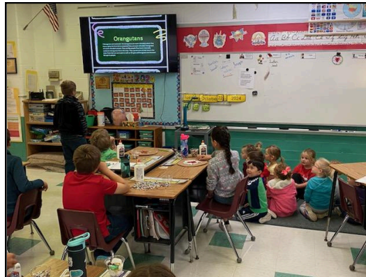
3rd Grade sharing animal presentations with preschoolers